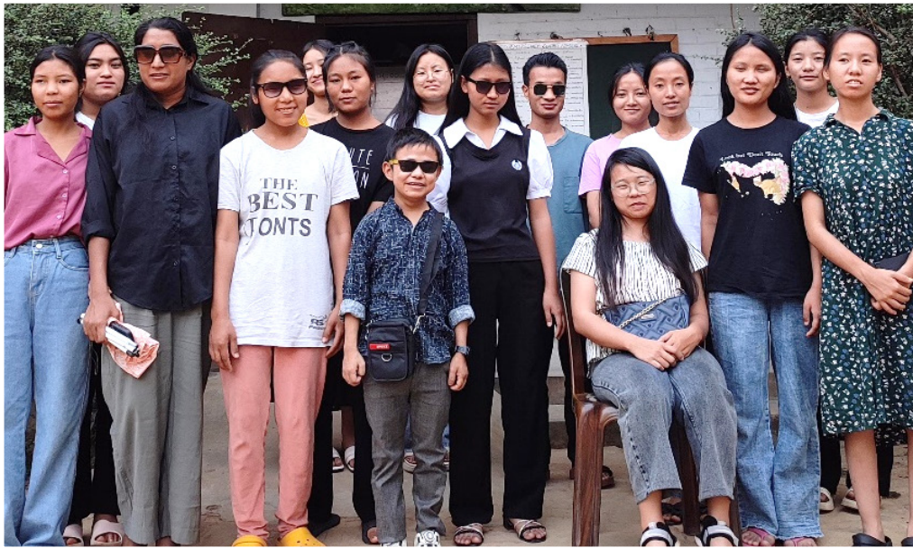
Sunday School teens having their quite time at the Teen's Retreat