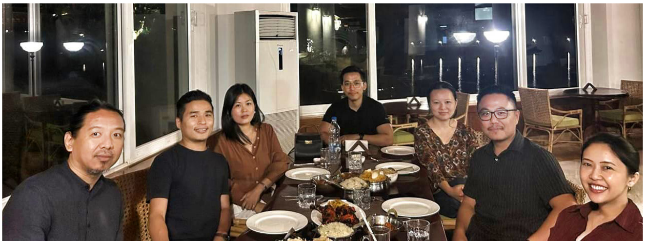
Editorial team with their spouses

The members of the Editorial Committee along with their spouses had a get-together fellowship over dinner at Jade Restaurant, Noune Resort on 27th April. It was a good time to strengthen friendships and also an opportunity to discuss the works related to the editorial team.