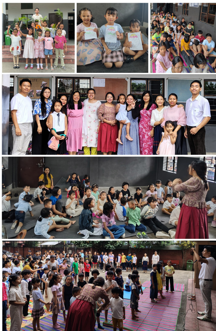
Collage of Sunday School activities at El-Shaddai Academy, Dimapur