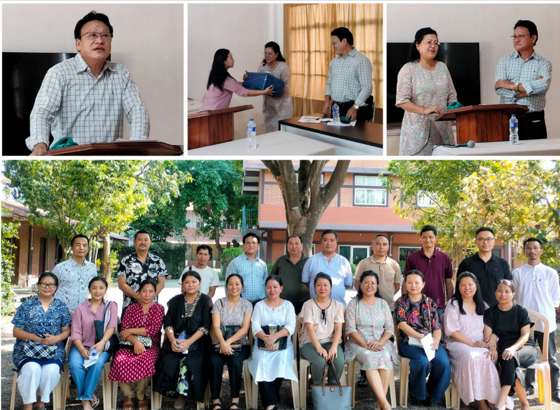
Editorial team with their spouses