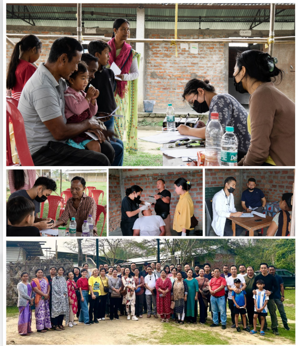
Snapshots from the medical camp at Sepon, Assam

We sincerely thank the CBCD members for their support through prayers and other contributions. May the Lord continue to use CBCD as an instrument to reach out and share His love with those in need.