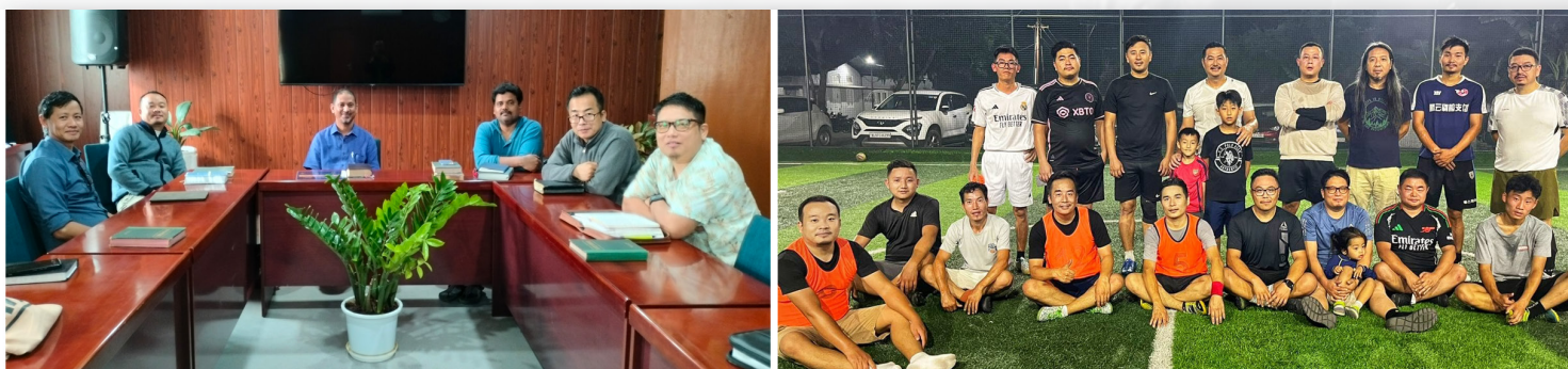
Men's Prayer Breakfast fellowship and Bible study at NMM Conference room and futsal match at Arena 365

The group also had a futsal match on 25th April at Arena 365, Kacharigaon, which was a good opportunity to bond and strengthen friendships through the sport. The men's group is also continuing with leading the praise and worship during the last Sunday of every month. We also meet up every Thursday evening at 5:30 PM for song practice. We welcome all the men of CBCD to come and join us for a time of fellowship, encouragement, prayer, sports for both spiritual as well as physical growth.