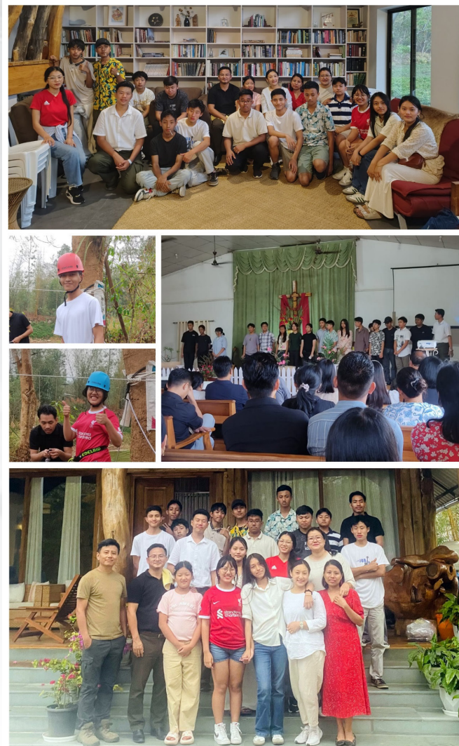
Snapshots of the Sunday School Teens' Retreat at Healing Garden, Medziphema and presentation of a skit on Good Friday