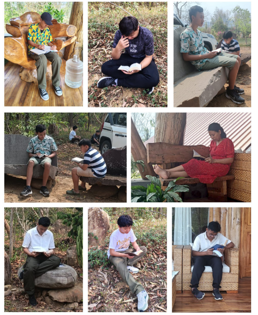
Sunday School teens having their Quite time at the Teen's Retreat