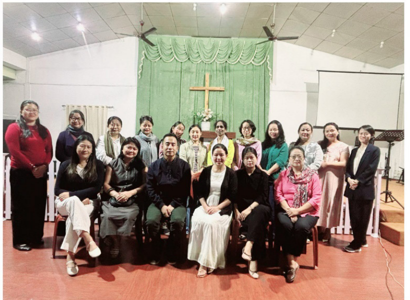
Women's fellowship home visitations and their first fellowship of the year