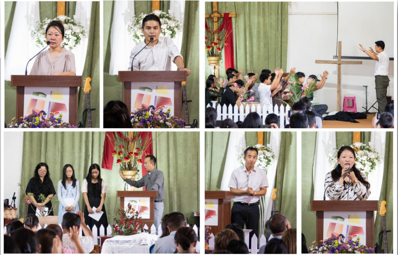
Glimpses of Passion Week at CBCD